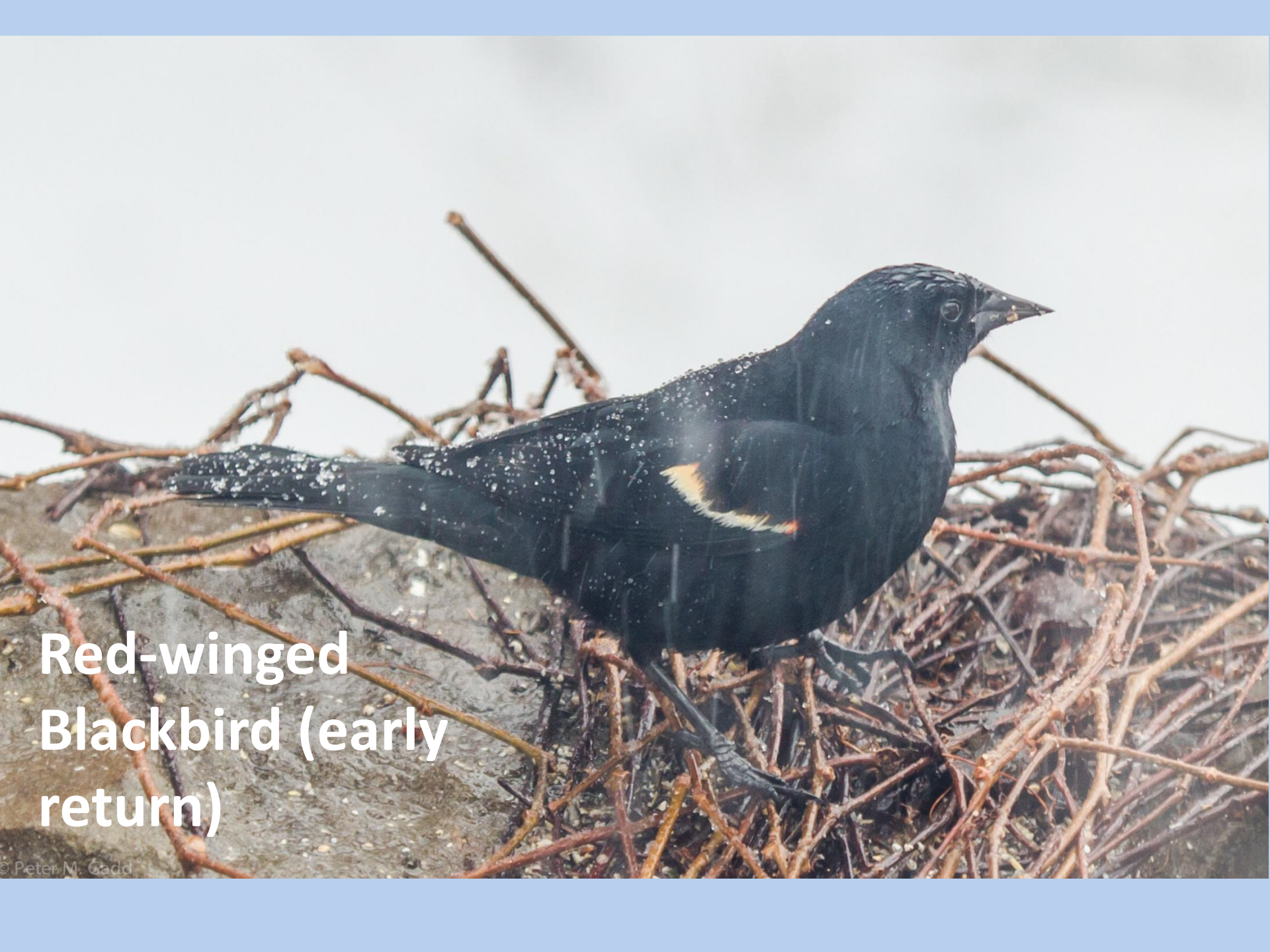
Red-winged Blackbird (early return)