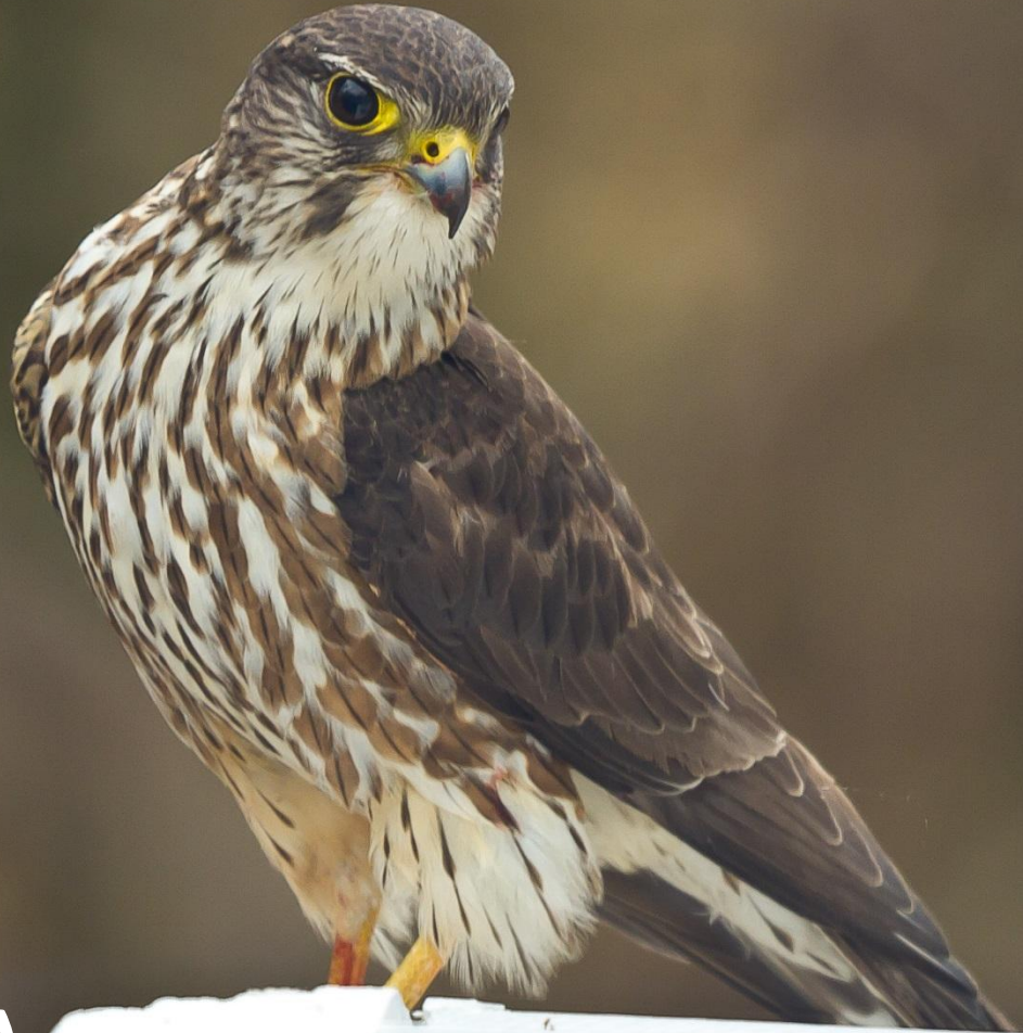
Merlin (a falcon)