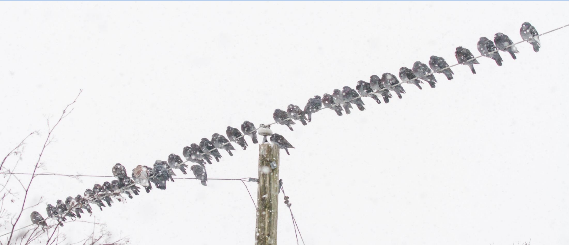
Rock Dove (Feral Pigeon)