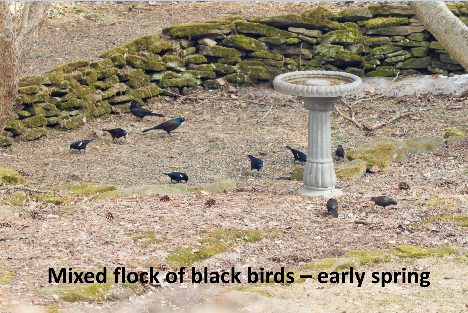
Mixed flock of black birds – early spring