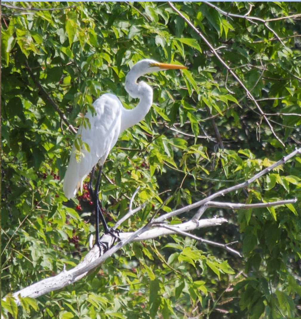
Great Egret (Newcastle)