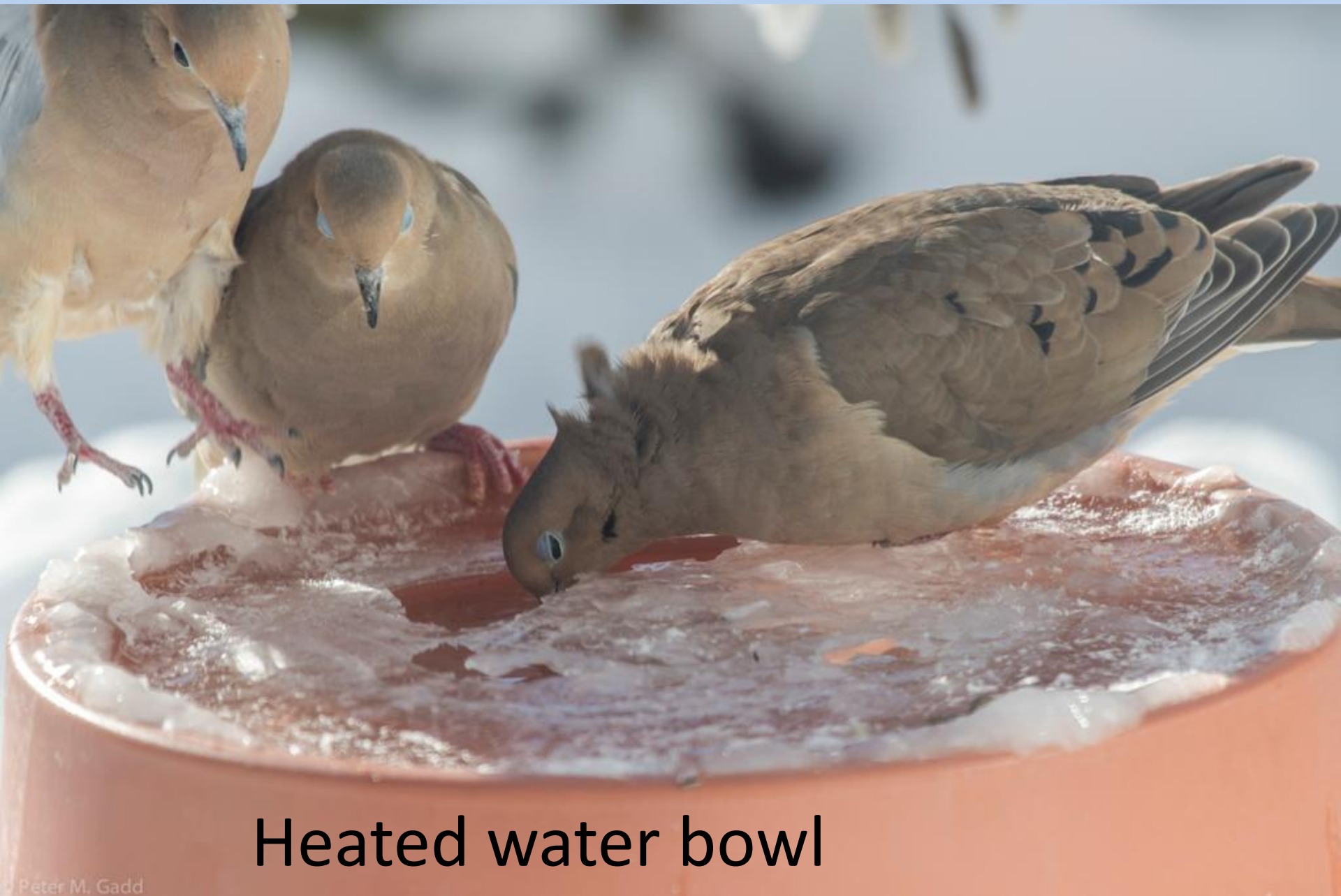
Heated water bowl