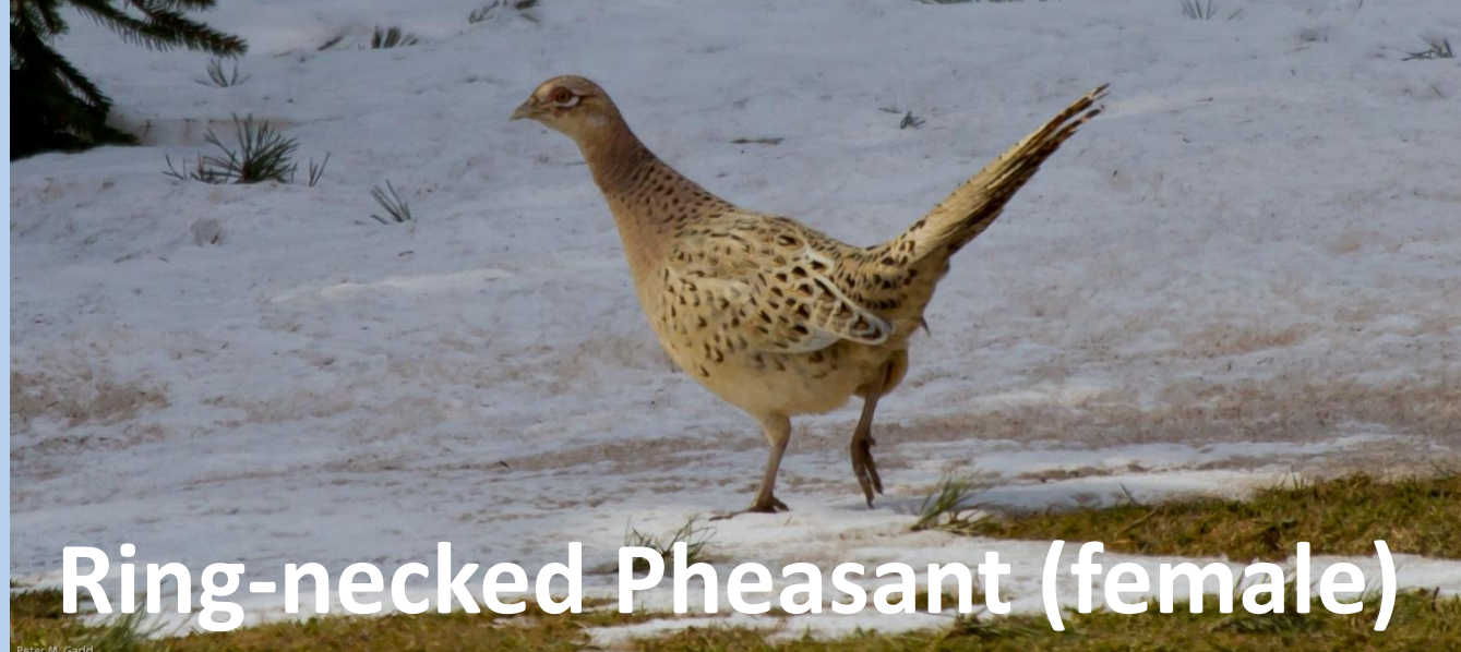
Ring-necked Pheasant (female)