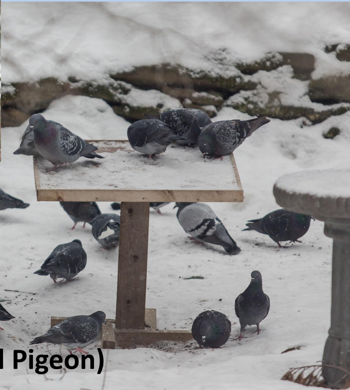
Rock Dove (Feral Pigeon)