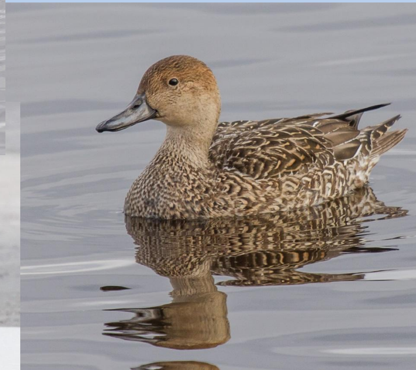
Mallard and Pintail Duck